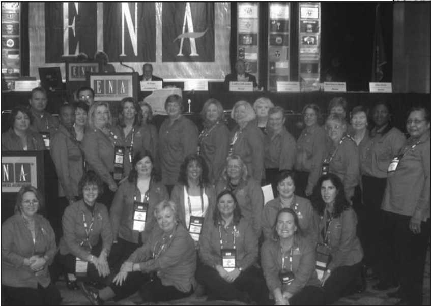
New York State Delegation