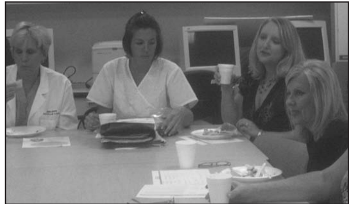
Suffolk ENA meeting