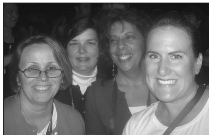
Enjoying the Stryker Party