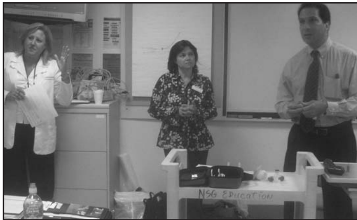
Suffolk ENA IO demonstration