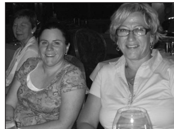
NYS ENA members enjoy dinner in Rochester