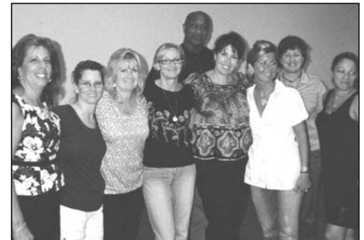
Emergency Nurses attended a CEN Review class sponsored by Nassau Queens Chapter